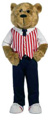
Ted the Tailor®

To find out about all the fun stuff happening on the day like the Insight Radio live broadcast, Build-A-Bear's Ted the Tailor mascot will be walking around the event, Lightbody Cakes specially designed cake, Eat Natural bars and much more visit our website www.abilityfest.org.uk